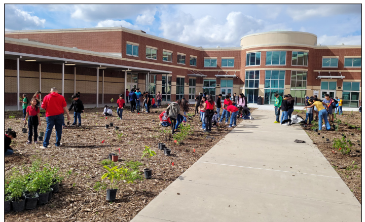
445 RHMS students participated in the Native Plant workshop planting 1,500 native plants.