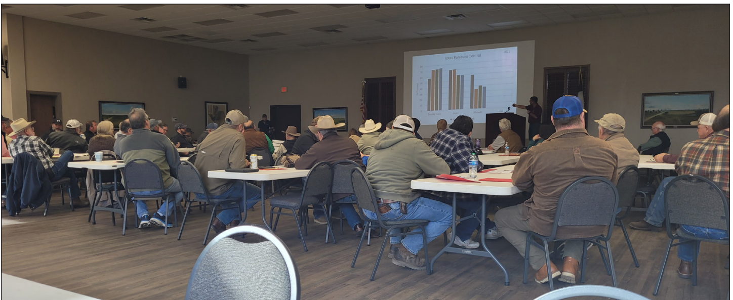
Attendees at the Annual RGV Cotton and Grain Pre-Plant Conference.