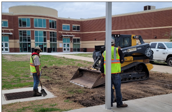
Removing the invasive grass and 2 inches of dirt.

After the grass and dirt had been removed, a layer of weed barrier fabric was rolled out and secured to the bare ground and 2 inches of mulch was applied to the entire planting area.